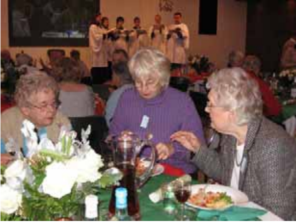
Some of Sutton Seniors' Forum Members enjoying Christmas lunch at Merrill Lynch office.