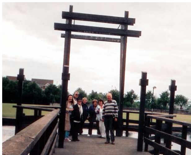
Who risk-assessed this route? It's a dead end!